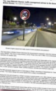
Should the speed limit be 80mph?

We also managed a fast response to a manipulative Evening Standard feature urging blanket 20mph zones as children apparently can't judge speeds over 25mph, and need to be 'safe' when they step out in front of traffic. Our reply pointed out the dangers of encouraging children to just step out, pointing out that is against the Highway Code/Green Cross Code, and that parents should instead teach them to find a safe place to cross.